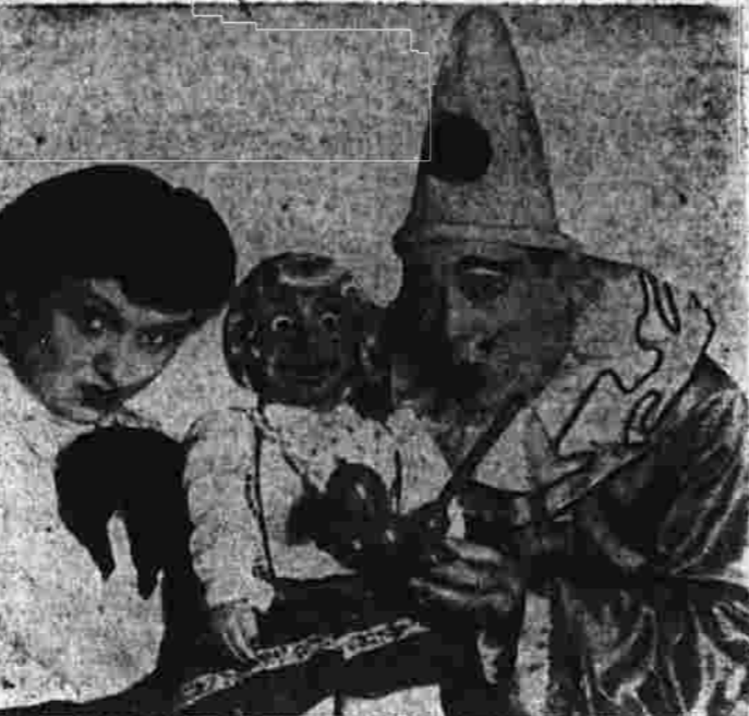
Bring the Children!